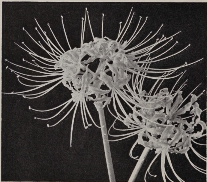
LYCORIS—Often Misnamed Nerine

Plant October to March in very rich soil and a sunny location. Plant 5 inches deep with sand base and see that they have abundant watering and not allowed to dry out until they bloom, then gradually withhold watering and leave dry all summer. Can be left in the ground for many years, each year improving in quantity and quality of bloom.